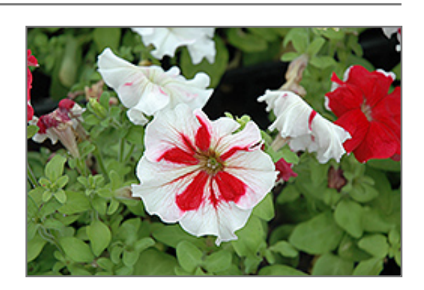
Hula Hoop Red Petunia flowers

Hula Hoop Red Petunia will grow to be about 10 inches tall at maturity, with a spread of 10 inches. When grown in masses or used as a bedding plant, individual plants should be spaced approximately 8 inches apart. Its foliage tends to remain low and dense right to the ground. This fast-growing annual will normally live for one full growing season, needing replacement the following year.