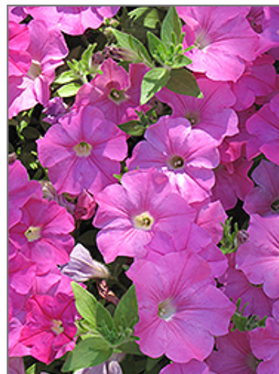
Easy Wave Pink Petunia flowers

Easy Wave Pink Petunia is recommended for the following landscape applications;