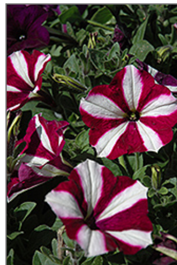
Easy Wave Burgundy Star Petunia flowers

Easy Wave Burgundy Star Petunia is recommended for the following landscape applications;