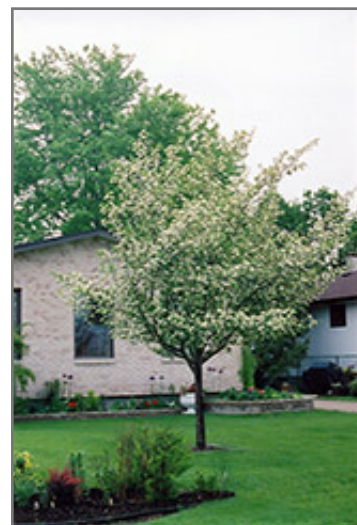
Snowbird Hawthorn in bloom