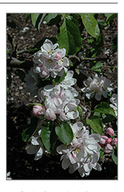
Golden Russet Apple flowers

Aside from its primary use as an edible, Golden Russet Apple is sutiable for the following landscape applications;