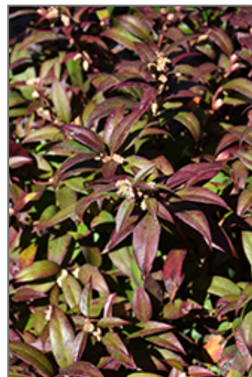
Scarletta Fetterbush flowers