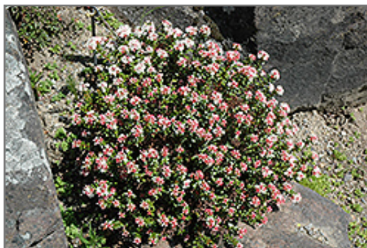
Sand Myrtle in bloom