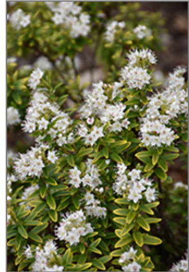
Sand Myrtle flowers

Sand Myrtle makes a fine choice for the outdoor landscape, but it is also well-suited for use in outdoor pots and containers. Because of its height, it is often used as a 'thriller' in the 'spiller-thriller-filler' container combination; plant it near the center of the pot, surrounded by smaller plants and those that spill over the edges. It is even sizeable enough that it can be grown alone in a suitable container. Note that when grown in a container, it may not perform exactly as indicated on the tag - this is to be expected. Also note that when growing plants in outdoor containers and baskets, they may require more frequent waterings than they would in the yard or garden.