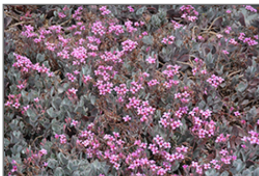
Flower Dust Plant in bloom