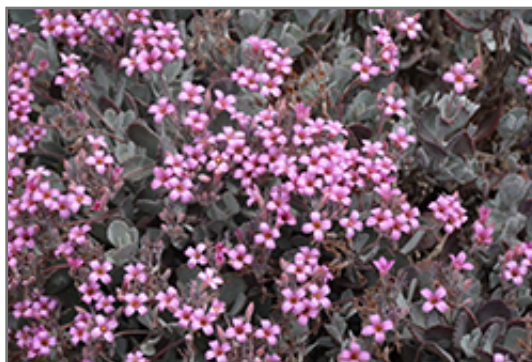
Flower Dust Plant flowers