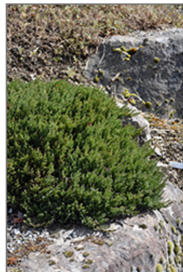
Grey Forest Juniper