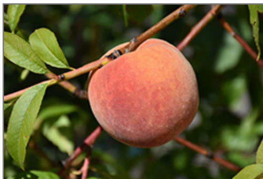
Redhaven Peach fruit

Redhaven Peach is covered in stunning clusters of fragrant pink flowers along the branches in early spring, which emerge from distinctive rose flower buds before the leaves. It has dark green deciduous foliage. The narrow leaves turn yellow in fall. The fruits are showy yellow drupes with a red blush, which are carried in abundance in mid summer. The fruit can be messy if allowed to drop on the lawn or walkways, and may require occasional clean-up.