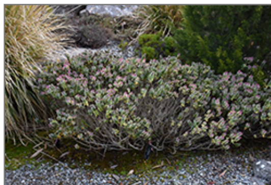
Silver Dollar Hebe