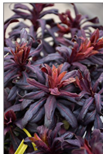
Ruby Glow Wood Spurge flowers

Ruby Glow Wood Spurge is recommended for the following landscape applications;