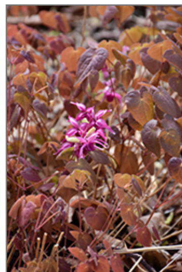
Yubae Bishop's Hat flowers

Yubae Bishop's Hat is recommended for the following landscape applications;