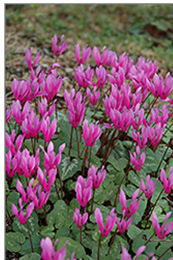
Purple Cyclamen flowers