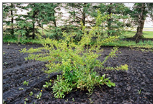
Sapalta Cherry-Plum