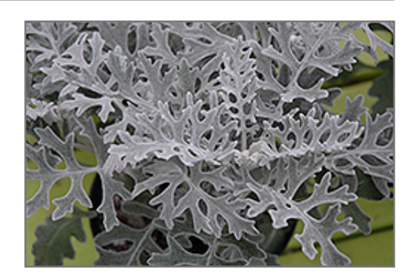
Silver Lace Dusty Miller flowers