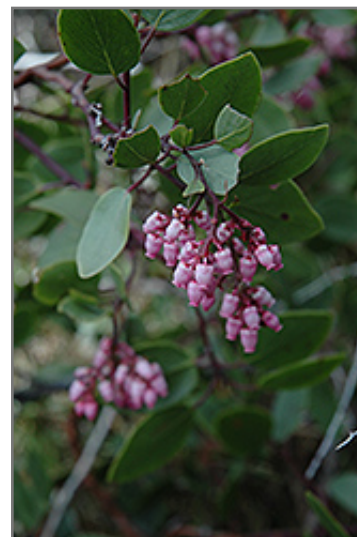
Greenleaf Manzanita flowers