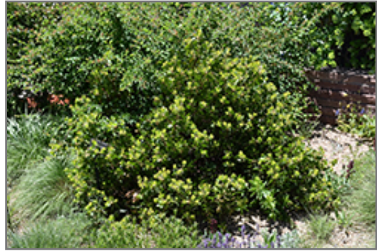
Greenleaf Manzanita

This shrub does best in full sun to partial shade. It is very adaptable to both dry and moist growing conditions, but will not tolerate any standing water. It is very fussy about its soil conditions and must have sandy, acidic soils to ensure success, and is subject to chlorosis (yellowing) of the foliage in alkaline soils, and is able to handle environmental salt. It is somewhat tolerant of urban pollution. This species is native to parts of North America.