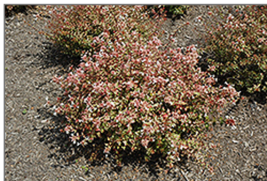
Sunshine Daydream Abelia in bloom