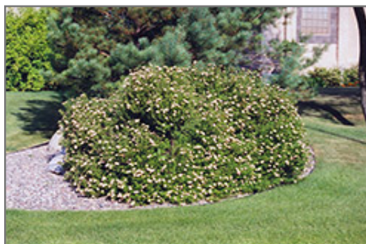
Pink Beauty Potentilla in bloom