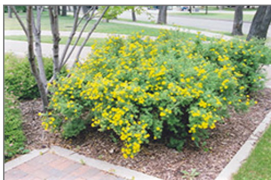
Coronation Triumph Potentilla in bloom