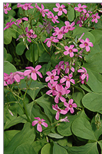
Pink Wood Sorrel flowers