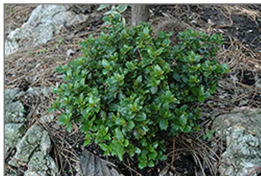
Little Rascal Meserve Holly