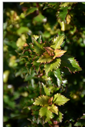
Little Rascal Meserve Holly foliage