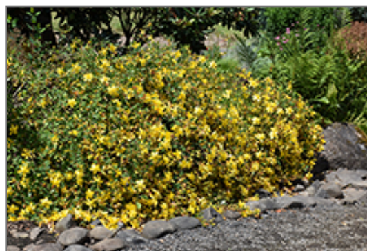
Hidcote St. John's Wort in bloom