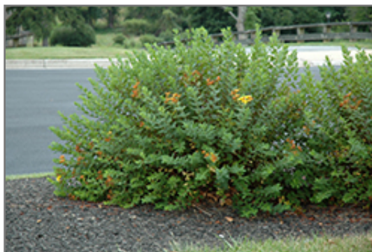
Hidcote St. John's Wort

Hidcote St. John's Wort makes a fine choice for the outdoor landscape, but it is also well-suited for use in outdoor pots and containers. With its upright habit of growth, it is best suited for use as a 'thriller' in the 'spiller-thriller-filler' container combination; plant it near the center of the pot, surrounded by smaller plants and those that spill over the edges. It is even sizeable enough that it can be grown alone in a suitable container. Note that when grown in a container, it may not perform exactly as indicated on the tag - this is to be expected. Also note that when growing plants in outdoor containers and baskets, they may require more frequent waterings than they would in the yard or garden.