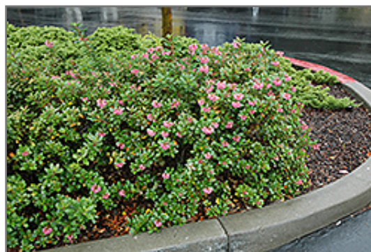
Newport Dwarf Escallonia in bloom