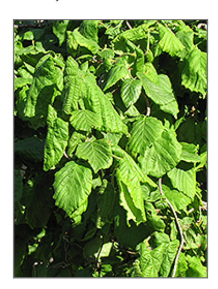
Harry Lauder's Walking Stick (tree form) foliage