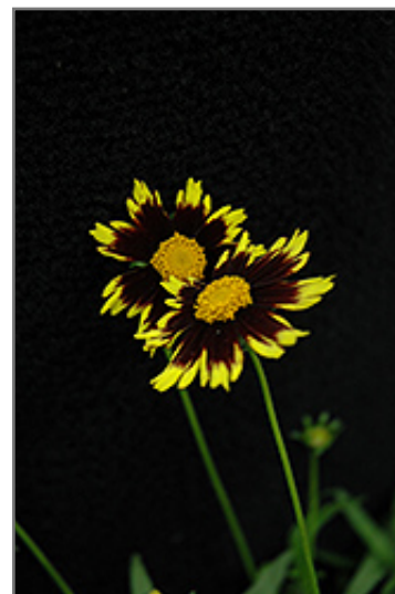
Cosmic Eye Tickseed flowers