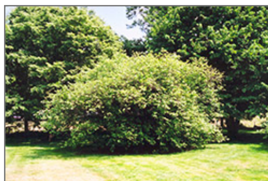
American Hazelnut