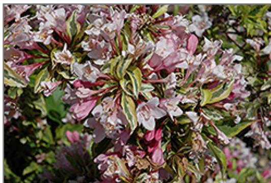
Rainbow Sensation Weigela flowers