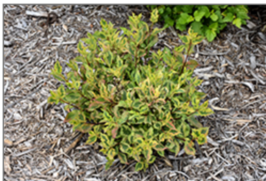
Rainbow Sensation Weigela