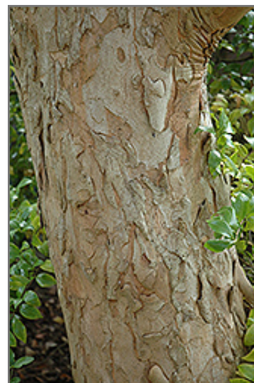
Water Gum bark