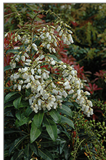
Mountain Fire Japanese Pieris flowers