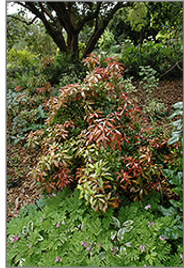
Mountain Fire Japanese Pieris

This shrub does best in full sun to partial shade. It requires an evenly moist well-drained soil for optimal growth, but will die in standing water. It is very fussy about its soil conditions and must have rich, acidic soils to ensure success, and is subject to chlorosis (yellowing) of the foliage in alkaline soils. It is somewhat tolerant of urban pollution, and will benefit from being planted in a relatively sheltered location. Consider applying a thick mulch around the root zone in winter to protect it in exposed locations or colder microclimates. This is a selected variety of a species not originally from North America, and parts of it are known to be toxic to humans and animals, so care should be exercised in planting it around children and pets.