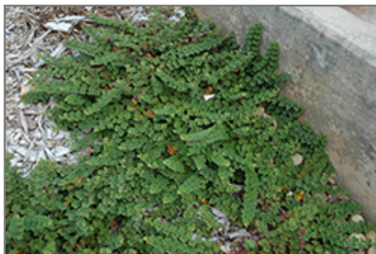
Emerald Carpet Raspberry