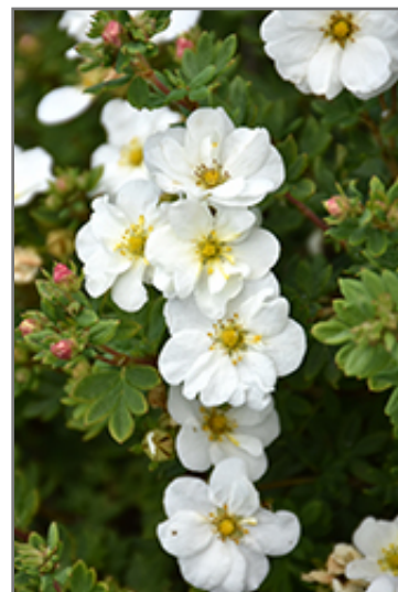
Frosty Potentilla flowers