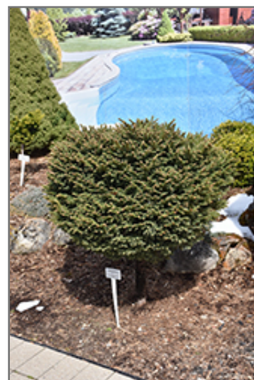
Little Gem Spruce (tree form)

Little Gem Spruce (tree form) will grow to be about 24 inches tall at maturity, with a spread of 24 inches. It has a low canopy with a typical clearance of 2 feet from the ground. It grows at a slow rate, and under ideal conditions can be expected to live for 50 years or more.