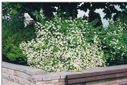
Galahad Mockorange in bloom