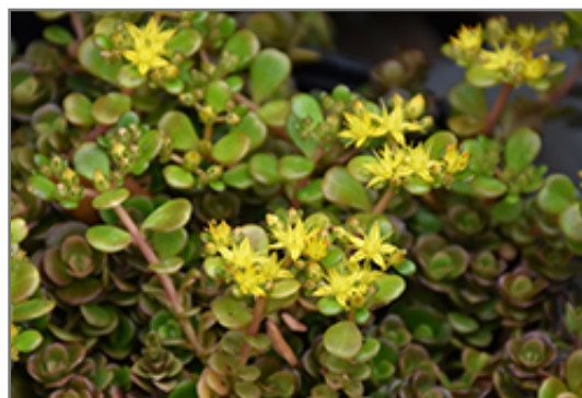
Chinese Sedum flowers