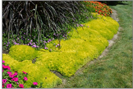
Lemon Coral Stonecrop

This plant is not reliably hardy in our region, and certain restrictions may apply; contact the store for more information.