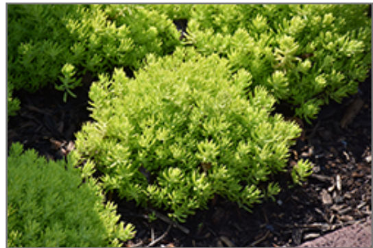
Lemon Coral Stonecrop