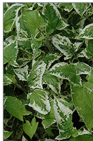
Fuji Snow Variegated Japanese Sage foliage

Fuji Snow Variegated Japanese Sage is recommended for the following landscape applications;