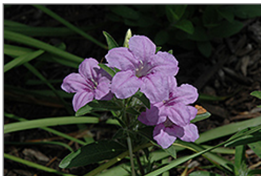
Hairy Wild Petunia flowers