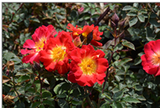
Ralph's Creeper Rose flowers

Ralph's Creeper Rose is recommended for the following landscape applications;