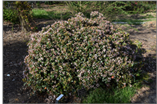
Eleanor Taber Indian Hawthorn in bloom