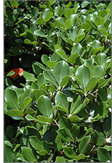
Eleanor Taber Indian Hawthorn foliage

This plant is not reliably hardy in our region, and certain restrictions may apply; contact the store for more information.