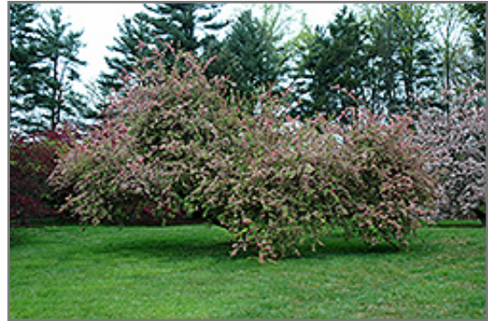
Bob White Flowering Crab in bloom

Bob White Flowering Crab is recommended for the following landscape applications;