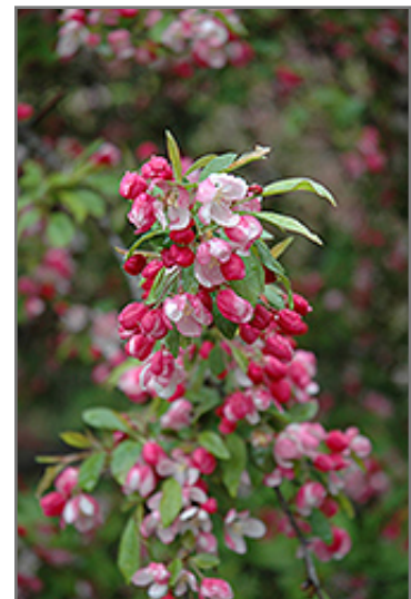
Bob White Flowering Crab flowers