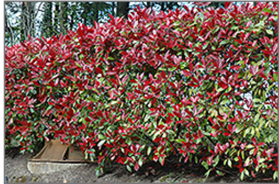
Red Robin Photinia