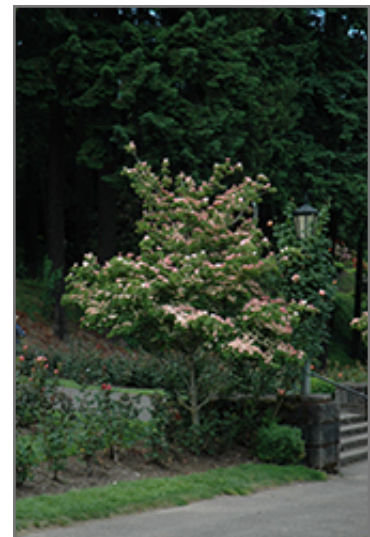
Heart Throb Chinese Dogwood in bloom