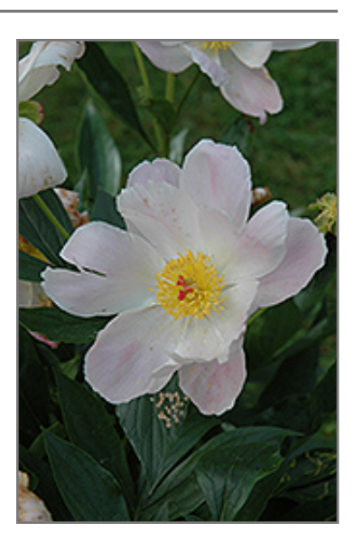
Duchess of Portland Peony flowers

Duchess of Portland Peony will grow to be about 30 inches tall at maturity, with a spread of 3 feet. When grown in masses or used as a bedding plant, individual plants should be spaced approximately 30 inches apart. The flower stalks can be weak and so it may require staking in exposed sites or excessively rich soils. It grows at a slow rate, and under ideal conditions can be expected to live for approximately 20 years. As an herbaceous perennial, this plant will usually die back to the crown each winter, and will regrow from the base each spring. Be careful not to disturb the crown in late winter when it may not be readily seen!