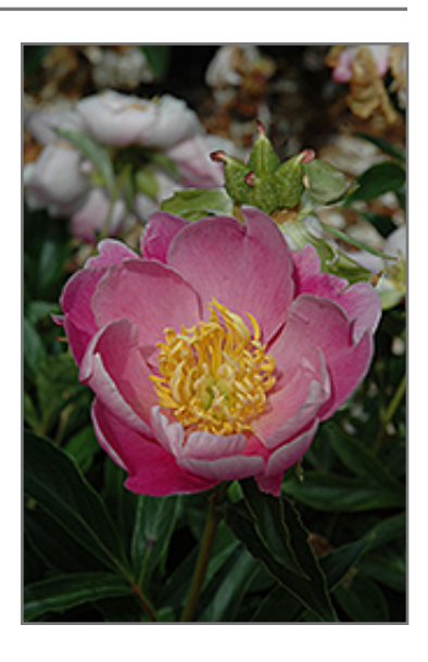
Apple Blossom Peony flowers

Apple Blossom Peony will grow to be about 30 inches tall at maturity, with a spread of 3 feet. When grown in masses or used as a bedding plant, individual plants should be spaced approximately 30 inches apart. The flower stalks can be weak and so it may require staking in exposed sites or excessively rich soils. It grows at a slow rate, and under ideal conditions can be expected to live for approximately 20 years. As an herbaceous perennial, this plant will usually die back to the crown each winter, and will regrow from the base each spring. Be careful not to disturb the crown in late winter when it may not be readily seen!