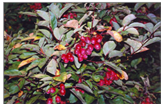
Adams Flowering Crab fruit