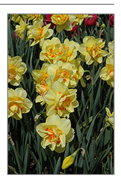
Tahiti Daffodil flowers