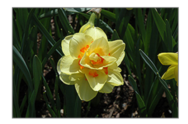
Tahiti Daffodil flowers