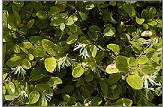
Snow Dance Fringeflower flowers