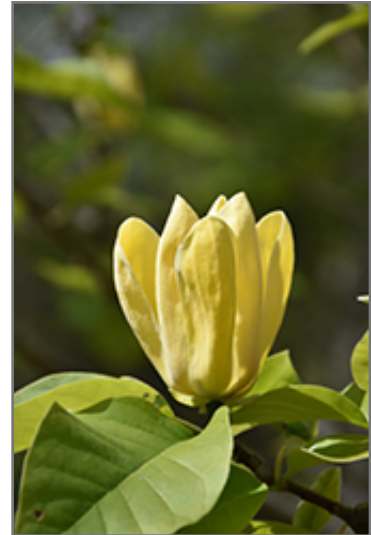
Yellow Bird Magnolia flowers

Yellow Bird Magnolia will grow to be about 40 feet tall at maturity, with a spread of 30 feet. It has a low canopy with a typical clearance of 5 feet from the ground, and should not be planted underneath power lines. It grows at a medium rate, and under ideal conditions can be expected to live for 80 years or more.