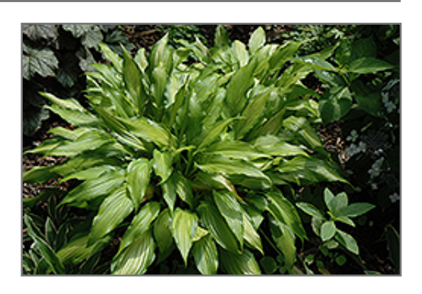
Yellow Splash Hosta